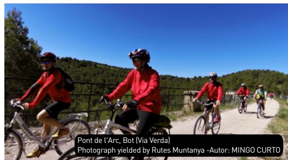
Pont de l'Arc, Bot (Via Verda)

the towns of Arnes, Horta de Sant Joan, Bot, Prat de Comte, Pinell de Brai, Benifallet, Xerta, Aldover, EMD Jesús, and Roquetes and is 100kms in total. The very slight climbs on the route which only varies by 400 metres accumulated, make it easy and suitable for those on foot and on horseback too. It includes a section for the disabled.