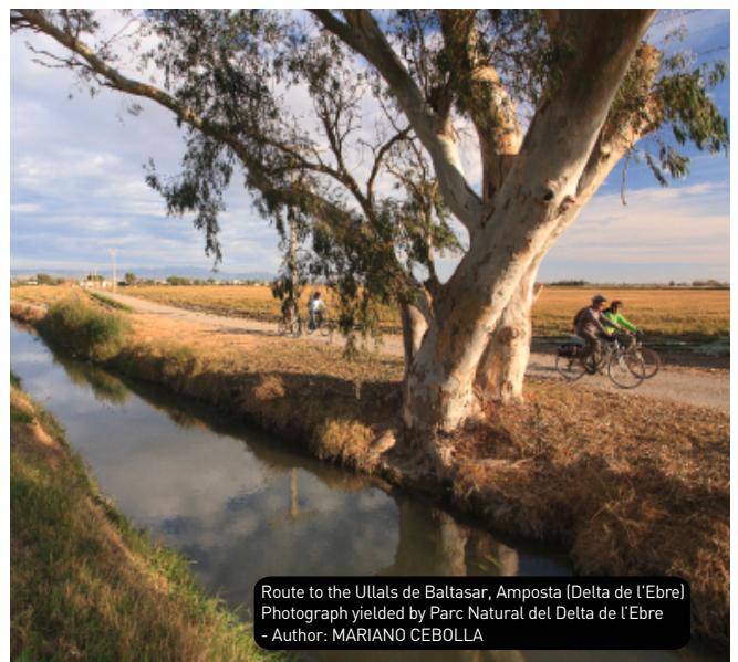
Route to the Ullals de Baltasar, Amposta (Delta de l'Ebre)

Visitors are well served by tourist information points and offices, including in both Protected Areas (Els Ports and the Ebro Delta), where they can find details on everything to do with the cycleways and related services.